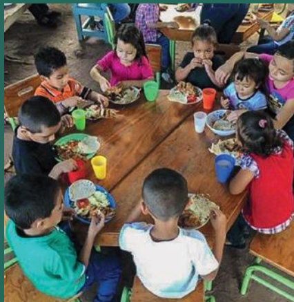
Mothers have learned how to prepare nutritious meals for their children.

95 percent of neighbourhoods now have trained health committees that oversee health, nutrition and immunisation programs, which will help ensure the health of community members into the future.